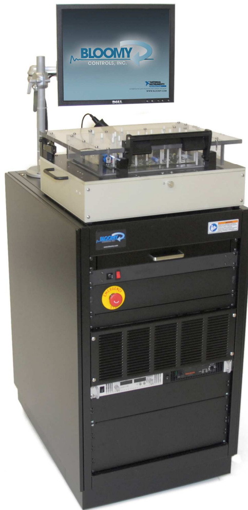
Figure 1: BMS Tester Base System