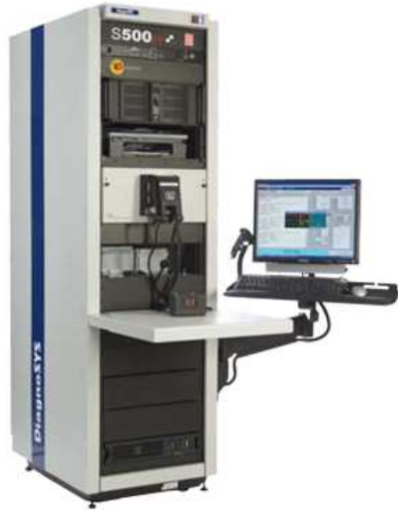
Figure 1: DiagnoSYS Test System

To test the functionality of this speed sensing equipment, the PXI digitizer is placed between the Doppler box and the speedometer and acquires the 2 KHz differential signal. The positive signal is routed into one channel on the digitizer and the negative signal is routed into the second channel. DiagnoSYS uses an onboard calculation channel to subtract the two channels to acquire the differential signal. Then they use the ZT450 PXI onboard measurements to gather the peak-to-peak voltage, frequency, and RMS of the signal. In software, they can compare these measurements to the expected values to verify that the Doppler box and speed sensor are working correctly.